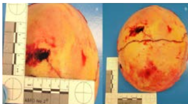
Figure 2- Entrance wound: gross appearance of the left parietal bone. a) Defect of the outer table. b) Short fracture line

Autopsy showed an oval penetrating wound in the left parietal bone (close to the midline) measuring 1.0 cm in diameter and exhibiting external bevelling and a small fracture line (entrance wound) (Figures 2 a, b).