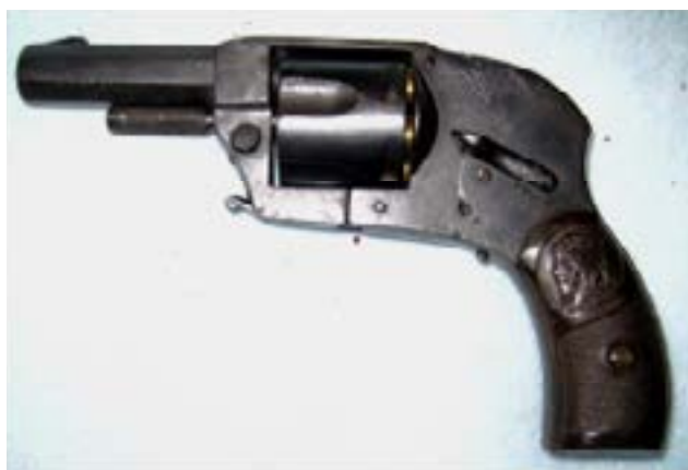
Figure 1- The .320 caliber pocket revolver found at the death scene

An 86-year-old man was found by his neighbour in the shower tray in the bathroom of his apartment, still gasping and bleeding from his head. He was taken to the hospital where he died approximately 20 hrs later despite neurosurgery and intensive care. At the death scene, blood stains and spatters were found in the shower tray, with downward cast-off stains on the shower walls at 1.0 meter from the ground.