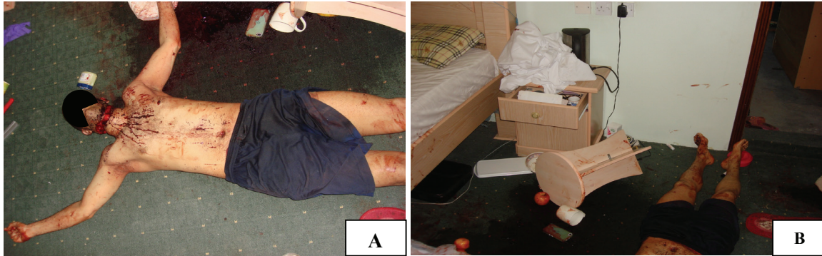
Figure 1- (A) and (B) Showing the position of the dead body at the death scene.