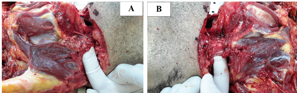
Figure 4- (A) and (B) show the spared carotid sheath within the cut-throat injury on both sides of the neck.