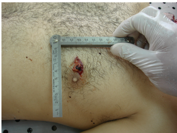
Figure 5- Stab wound found in the chest.

en, was an unemployed male suffering from a psychiatric illness (severe depression) and was under medication and even though he lived with his family, he was considered a loner and isolated as he was not married and lived in a separate room. According to the American Foundation for Suicide Prevention, suicide most often occurs when stress and health issues dominates to create an element of hopelessness and despair. Depression is the most common condition associated with suicide. Other risk factors and warning signs that also can affect are relationship problems, isolation, and unemployment [8]. A similar case was reported when a 27-years-old male attempted to commit suicide by cutting his throat after prolonged mental depression as a consequence of long term unemployment and poverty [9]. A study completed in India on cut-throat suicidal victims reported that the majority of cases were young adults, 82.35% in the age group of 20-40 years, 47.05% were suffering from acute and tran-