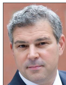
Prof. Michael Tsokos Member, AJFSFM Editorial Board

I hope that the AJFSFM will receive many good articles, and will enforce strict criteria for the acceptability of papers. Scientific journals provide an excellent way to disseminate methods, results, and experience among fellow scientists. I hope that it fosters good science in the Middle East and the Arab world, so we can all benefit from the work that is performed exclusively for the sake of justice in the world.