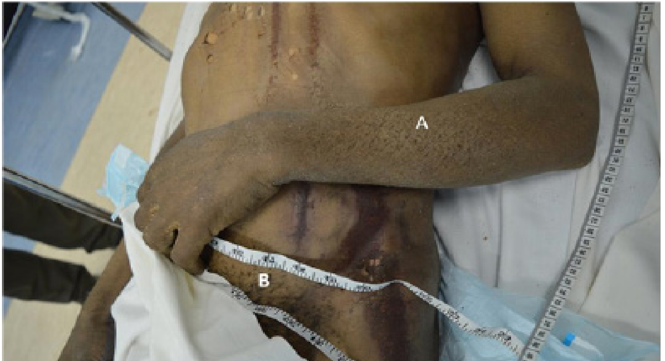
Figure 1- Singed hair on the back of the left forearm and in the pubic area caused by lightning strike.