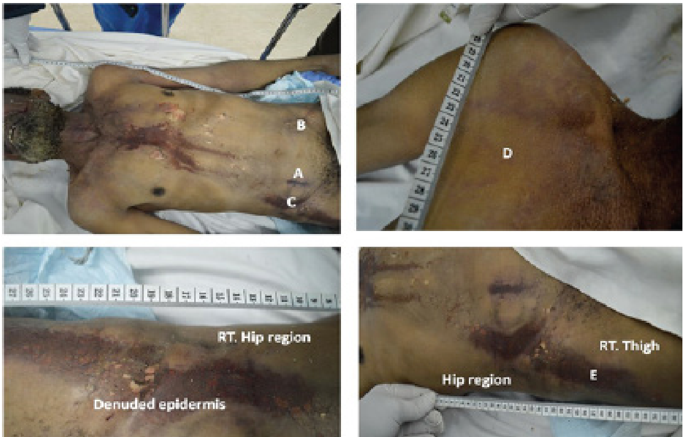
Figure 2- Multiple third degree skin burns due to lightning strikes. The largest one is seen in the middle of the front of the chest with 2 smaller radiating burns to the upper abdomen. A, B, C and E are degree burns in the lower abdomen and upper right thigh. D showing Fern sign area of erythema on the right shoulder.