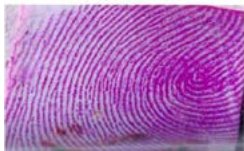
Figure 2- A fingerprint developed on lamination sheet.