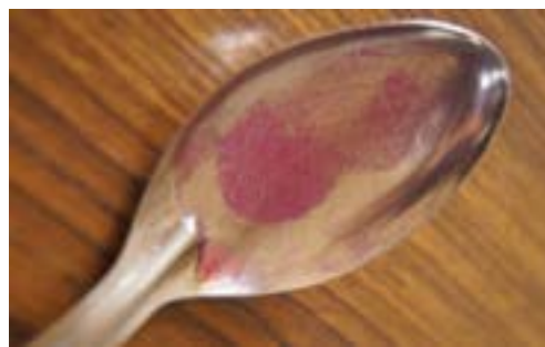
Figure 7- A fingerprint developed on a wet item.

The sparingly soluble components of sweat residue do not normally react with the solution of the developing reagent. However, the phase transfer catalyst brings about a rapid interaction between these components and an aqueous solution of xanthene dye develops good quality fingerprints.