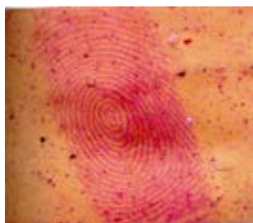
Figure 4- A fingerprint developed on packaging tape.

The reagent formulation was used to detect finger marks on two commercial varieties of recordable compact disks, viz. Maxell and Eurovision and two re-writable varieties, viz. Amkette and Moserbear. The composition developed