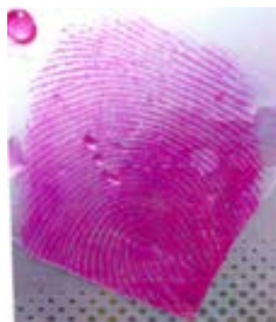
Figure 1- A fingerprint developed on glossy paper.

The present composition is not only non-toxic, but it is prepared in water. In the ninhydrin method, the reagent is