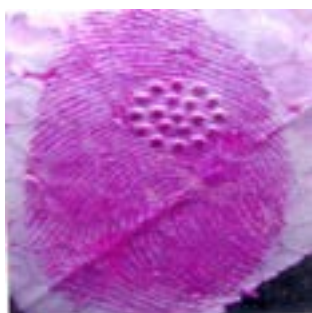
Figure 5- A fingerprint developed on thermo cool.